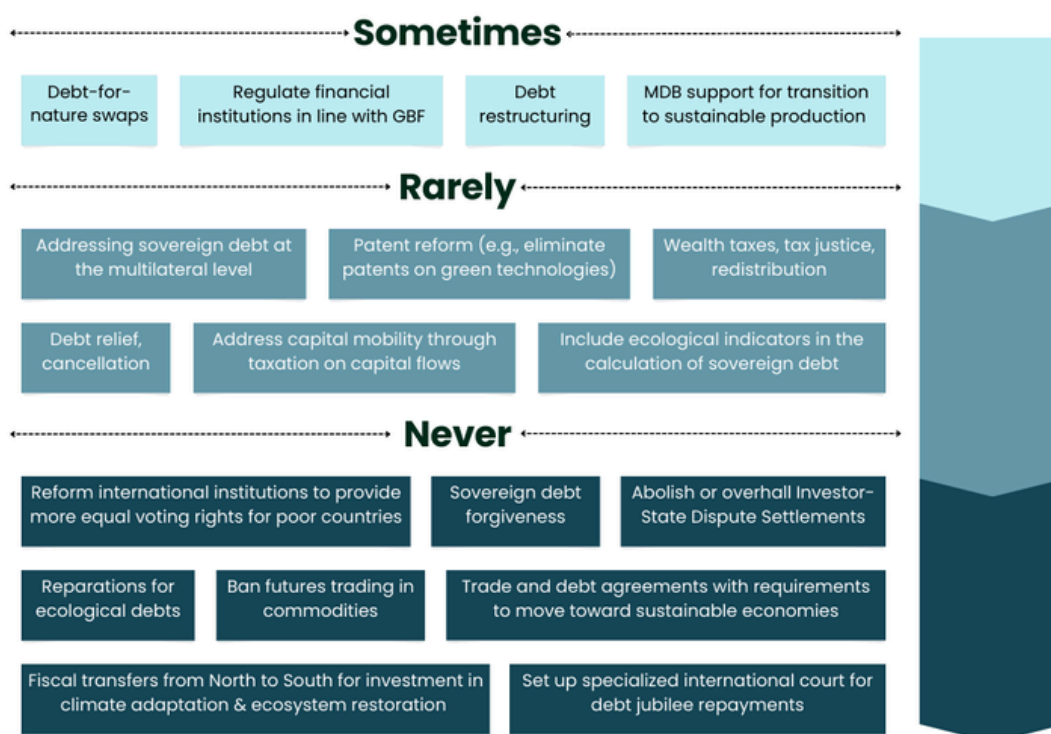
Figure 2. Extent to which recommendations from participants appear in biodiversity policy debates

In the figure below, we synthesized and sorted each recommendation based on whether it was included in biodiversity policy debates always, sometimes, rarely, or never. Included in figure 2 are the most common ideas that were put forth. The figure illustrates how the majority of policy interventions suggested by respondents are rarely or never included in biodiversity policy debates.